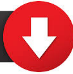
Table No. 21 3 Movie Download Kickass 720p Torrent